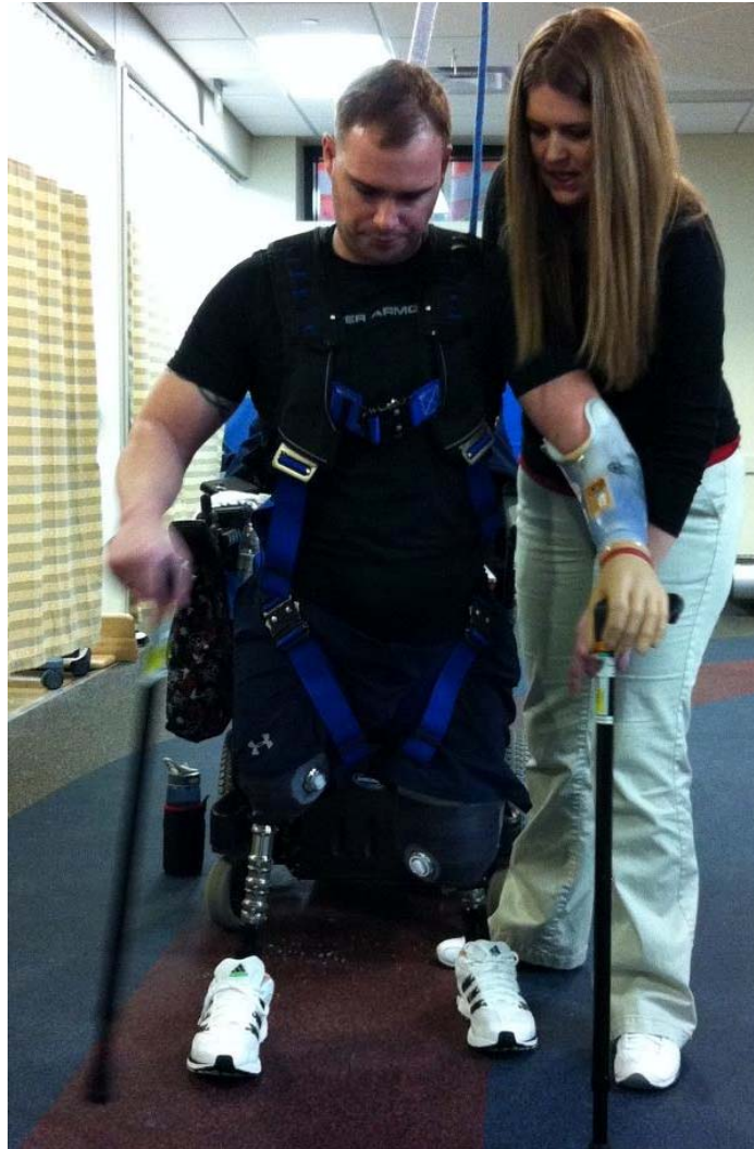
Rehabilitation at the National Naval Medical Center in Bethesda, Maryland.